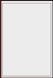
COVER 8.25 x 11" Includes 0.125" bleed