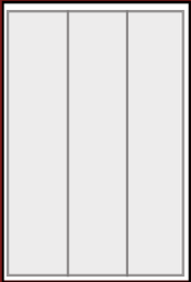
FULL PAGE 7 x 9.5"